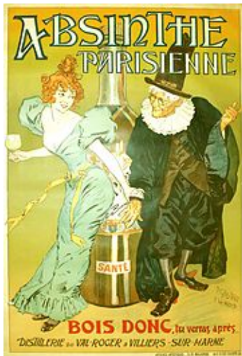
Figure 4: Remember informed consent: Before giving consent to drinking this absinthe, be informed that you will feel like shit in the morning.

Now that’s an interesting question. Essentially, the answer is to a) know your limits and b) stop when the disposable cash and/or fun runs out, whichever comes first.