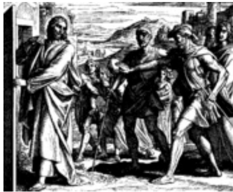
Figure 3: Jesus’s acts and sermons are a slight improvement on the Old Testament content, but their value as a verifiable historical account is questionable.

the related but divergent religious stories of Israel and Judaea into a common tradition, and any previously believed gods into the single personage of YHWH, the God now worshipped, in various variations, by Christian, Jewish, and Muslim traditions, ruthlessly suppressing other traditional Semitic faith elements in favor of those that promoted Judahite—Jewish—identity. From the original documents of the faith—believed to have developed into the modern Book of Deuteronomy—came an immense anthology of literature relating the history and faith of the Jewish people and their struggles to retain an identity of their own in the face of cultural encroachments of regional powers. Middle East researchers have found a great many elements common to many other Semitic peoples in the area—many of the details of Noah’s Flood date back to the Sumerian (i.e. pre-Semitic) Epic of Gilgamesh, for example, and the Book of Job is known to be an elaboration on an ancient pan-Semitic folktale. This is the Jewish Bible.