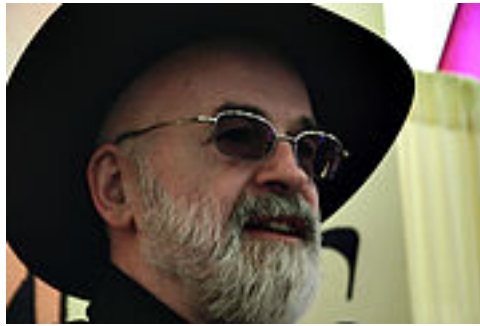
Figure 5: Terry Pratchett, on being diagnosed with early onset Alzheimer's disease became a vocal right-to-die spokesperson and was openly an atheist. On religious objections to euthanasia: "The problem with the God argument is that it works only if you believe in God, which I do not."

Atheism, as it is, doesn't say much about this subject. Well, as atheism is a statement of lack of belief, it precisely says nothing about the subjects. So anyone who has lost faith in a religion is free to choose whether they like these options or not based on their own ideas — perhaps you had a gut instinct to be pro-choice but were stopped by beliefs? We don't mean to presume, but do feel free to follow what you think, rather than what others are telling you to think. Despite the smears by the Religious Right, atheists, rationalists and humanists value life as much as any other person, and it is up to them to choose what they would do in that situation and not to force that view on to others. Really only a very few people deserve to be smeared with the label "pro-death". The issue could be summed up in the phrase "safe, legal and rare", which acknowledges